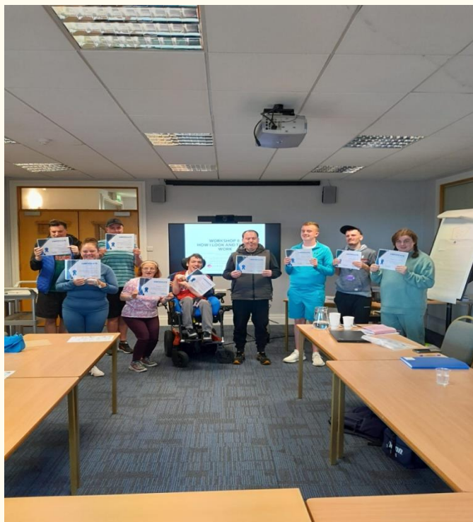
Work skills workshop participants