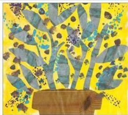
Texas Art winner by Divine Ayubowa