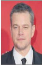
Touched . . . Damon