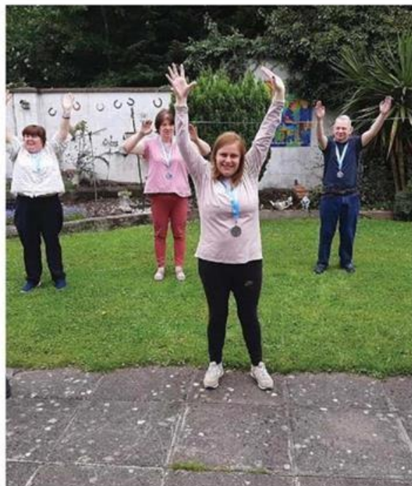
St Michael's House fundraiser.