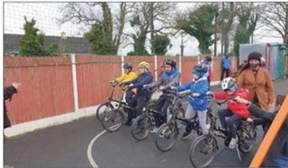
Fingal County Council Sports Office present St Michael's House with new bicycles.