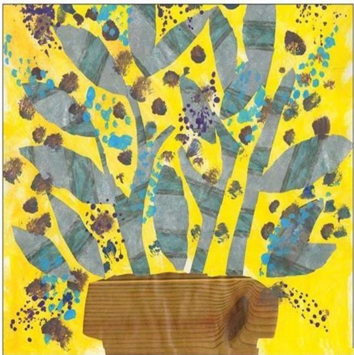
Texaco Art winner by Divine Ayhahowa