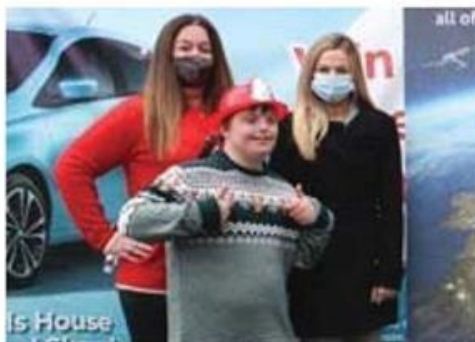
LOCAL HEROS: The lads from Skerries Fire Brigade are a big hit with all the students of St Michael's House