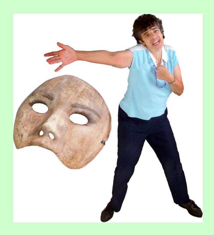
QQI Level 2 Drama M2A22